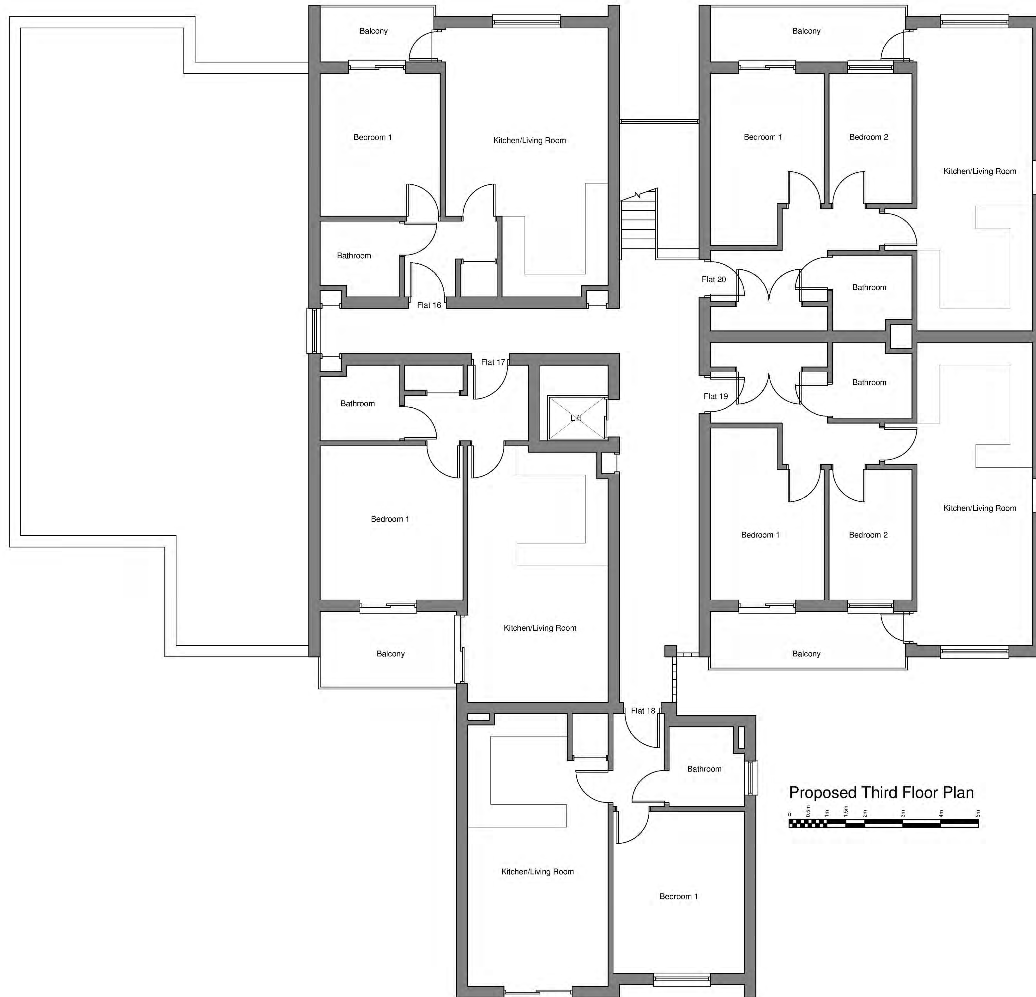
Proposed Third Floor Plan